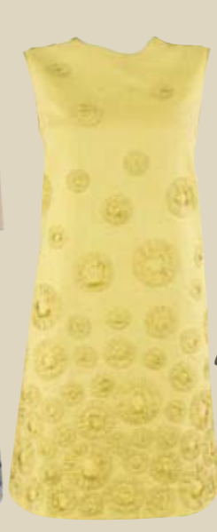
NANDITA BASU PRICE: Rs 9,500 Size: Small