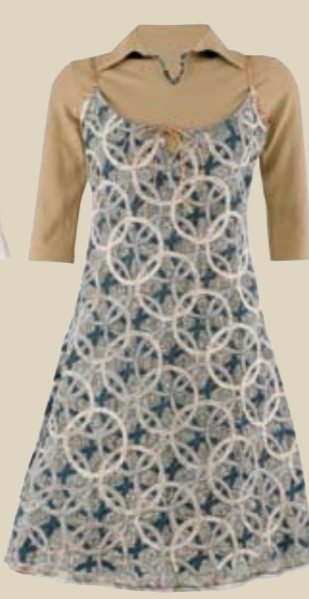
RAVAGE BY RAJ SHROFF AND NEETU GUPTA PRICE: Rs 12,000 Size: Small