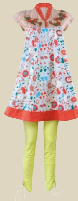
DEV R NIL PRICE: Rs 10,000 Size: Small