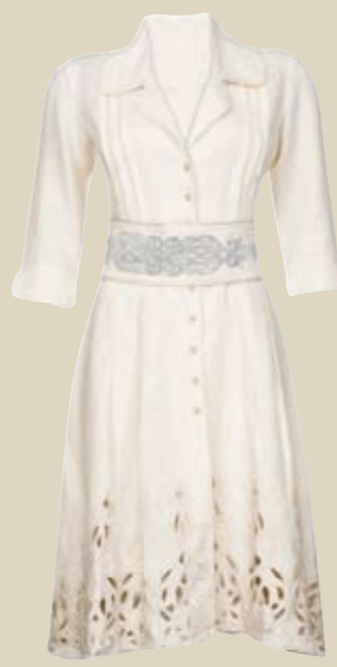
GURPREET FLEMING FOR BIAN PRICE: Rs 7,625 Size: Medium