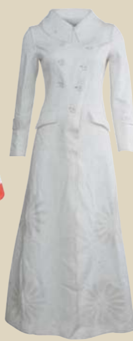
RAJESH PRATAP SINGH PRICE: Rs 22,000 Size: Small