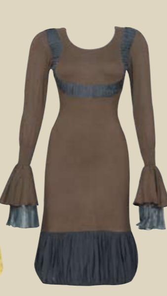
ROHIT BAL PRICE: Rs 18,000 Size: Small