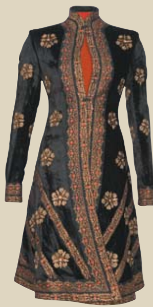
MANISH ARORA PRICE: Rs 35,000 Size: Small